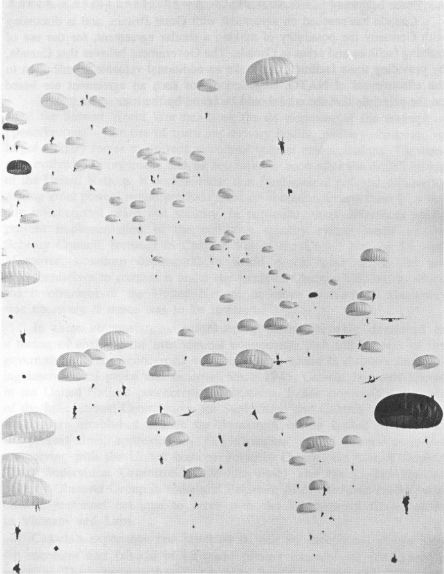
Air drop by Canadian Airborne Regiment demonstrates mobility of the Forces.

Standing Naval Force Atlantic (STANAVFORLANT) which operates continuously under the control of the Supreme Allied Commander Atlantic (SACLANT) and Canada will continue to contribute ships to this multinational force. This force enhances NATO's ability to respond rapidly and at an appropriate level to any developing situation.