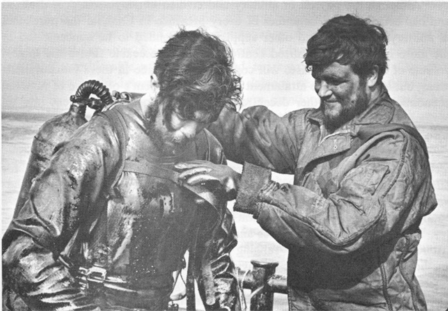
Canadian Forces provide expertise and practical help in pollution clean-up.

The work of the Armed Forces, in concert with DRB as part of the Ministry of Transport Task Force during the clean-up operations after the tanker Arrow went aground in Chedabucto Bay last year, illustrates their competence in this field. The Department of National Defence provided a wide range of services and skills, including a base vessel, skilled divers, an emergency communications centre, quick-reacting transportation, special