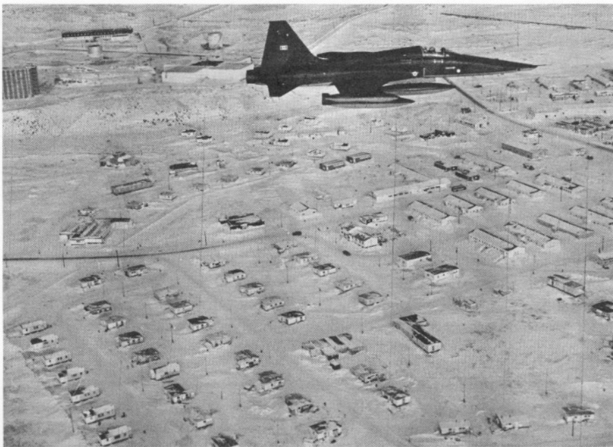
A CF-5 flies over Frobisher Bay on a long-range deployment exercise in Arctic.

of these aircraft to Allied Command Europe in photographic reconnaissance and ground-support roles. They would be Canada-based and flown across the Atlantic using the Forces' jet transports for in-flight refueling. One squadron would be available for the AMF(Air) in the north; the other would be in support of the Canadian air/sea transportable combat group committed to the same region. This decision will enhance NATO's deterrent strength and add to its ability to carry out the strategy of flexibility in response, which requires emphasis on conventional capability.