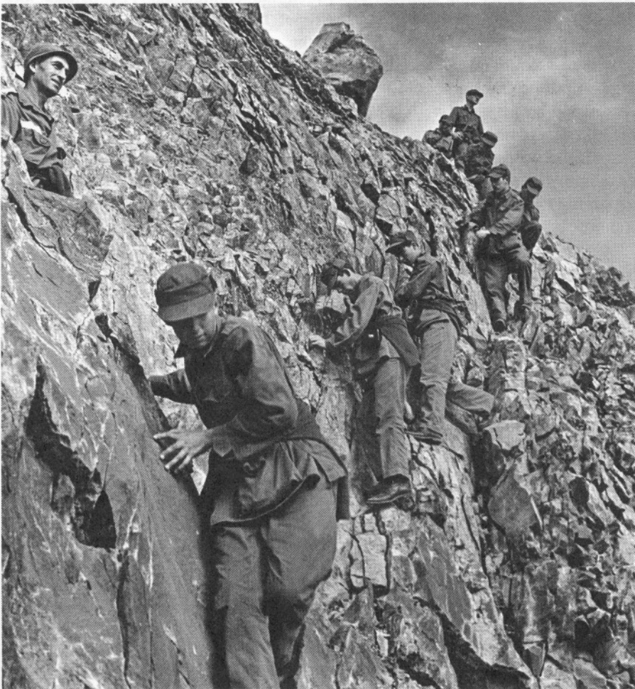
The cadets find adventure as well as citizenship training in their program.

The present Reserve Force has been designated as part of the "forces in being". Therefore the composition must be adjusted from time to time to keep pace with changes in overall force manpower, and cannot be considered in isolation from the Regular Force. In addition, many members of the Reserve Force, by virtue of their civilian occupations, will not always be immediately available in time of emergency. Furthermore, only the Regulars