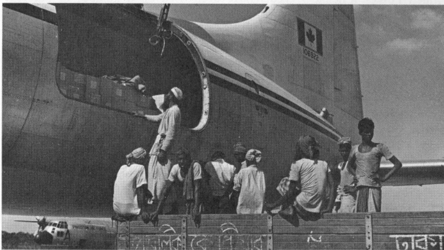
Forces play major role in Canada's international emergency relief operations.

While the Forces' aircraft provide an adequate long-range air capability at this time, the requirement will be kept under review so that the sufficient