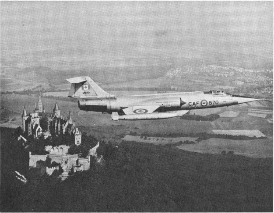
CF-104 aircraft comprise Canada's air contribution to NATO forces in Europe.

Continuing Factors: A catastrophic war between the super powers constitutes the only major military threat to Canada. It is highly unlikely Canada would be attacked by a foreign power other than as a result of a strategic nuclear strike directed at the U.S. Our involvement would be largely a consequence of geography; Canada would not be singled out for separate attack. There is, unfortunately, not much Canada herself can do by way of effective direct defence that is of relevance against massive nuclear attack, given the present state of weapons technology, and the economic restraints on a middle power such as Canada.