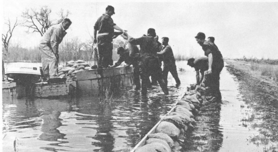
Regulars and Reserves are often called upon to assist the civil authorities.