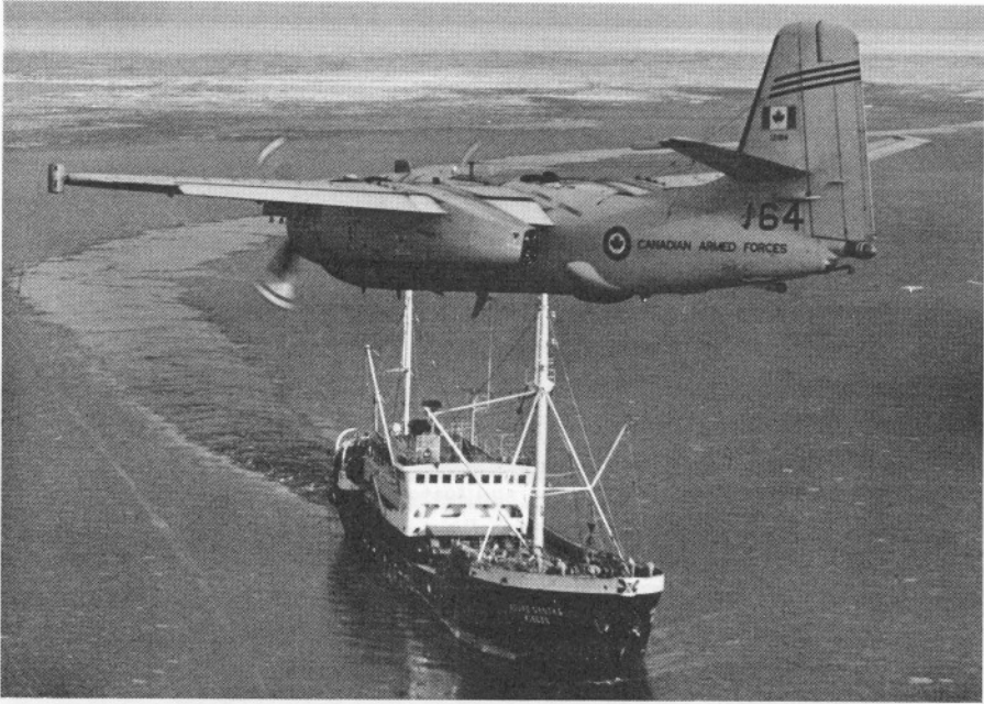
Land-based Tracker aircraft carry out surveillance over our coastal waters.

The Government has taken decisions with respect to the limits of Canada's territorial sea and fishing zones off the East and West coasts. Modern fishing techniques have resulted in a concern for the conservation of fishing resources in these areas. Legislation has extended Canada's territorial sea from three to twelve miles, and the former nine-mile contiguous fishing zone has been incorporated within the extended territorial sea. At the same time, new and extensive Canadian-controlled fishing zones have been created in areas of the sea adjacent to the coast. An order-in-council has been promulgated establishing such fishing zones in Queen Charlotte Sound, Dixon Entrance and Hecate Strait on the West Coast, and the Gulf of St. Lawrence and the Bay of Fundy on the East Coast, a total area of 80,000 square miles. Against the possibility of potentially disastrous oil spills, pollution control is also to be exercised in these areas.