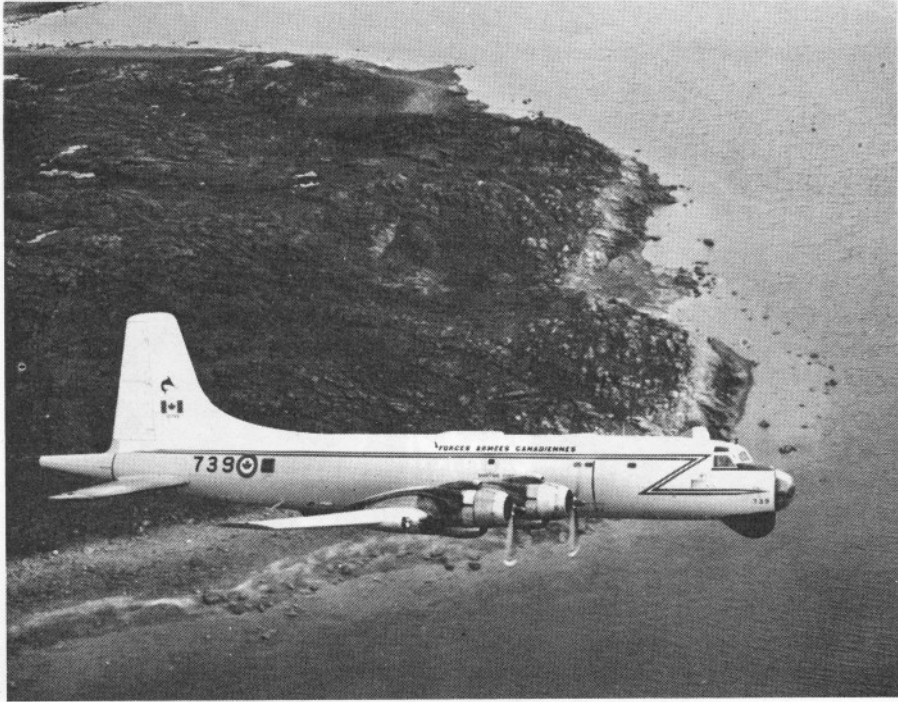
On a northern surveillance flight, an Argus flies over Baffin Island coast.

Departmental Responsibilities and Relationships: The Government's objective is to continue effective occupation of Canadian territory, and to have a surveillance and control capability to the extent necessary to safeguard national interests in all Canadian territory, and all airspace and waters over which Canada exercises sovereignty or jurisdiction. This involves a complex judgment on the challenges which could occur and on the surveillance and control capability required in the circumstances.