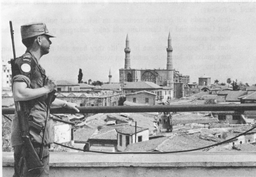
Canada has contributed to all UN peacekeeping operations, including Cyprus.

Greater stability in the last few years has been accompanied by an increased willingness to attempt to resolve East-West issues by negotiation,