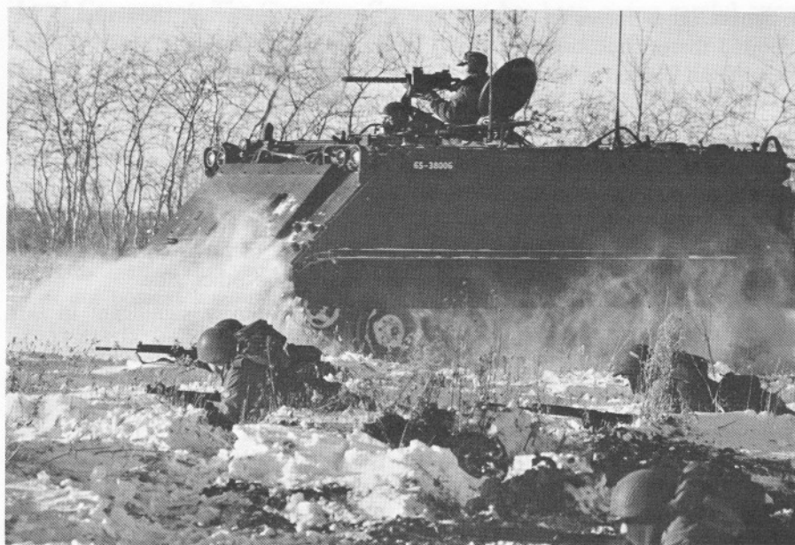
Backed up by an armoured personnel carrier, Canadian troops train in winter.

Europe were not reduced. The Government reached its decision after an exhaustive examination of all factors bearing on national security. The decision did not suggest an overall reduction in NATO-wide defence, although Canada hopes that East-West negotiation will render this possible in the future. What Canada was seeking was a redistribution of effort for the defence of the European part of the Treaty area. The reductions were preceded by full consultations and implemented over a two-year period to permit internal adjustments to be made by members of the Alliance.