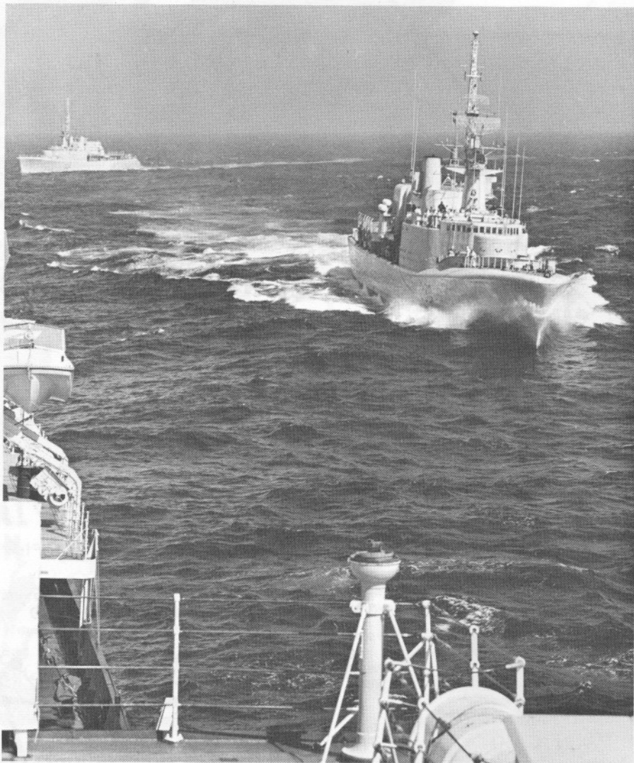
Canadian destroyers from Maritime Command on NATO exercise in the Atlantic.

The Canadian Forces are conducting an extensive test program on the hydrofoil craft, Bras d'Or, which was designed and built in Canada. A decision on procuring hydrofoil craft for surveillance and control will be