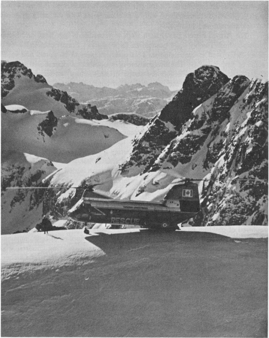
Search and Rescue continues to be an important function of Canadian Forces.

For its part, the Government will ensure that Canada shall have a highly trained and well-equipped force capable of responding to the variety of challenges discussed in the Paper.